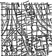
SITE PLAN @A1 1:1250

CDM 2015: Under the CDM regulations there are no significant design risks.